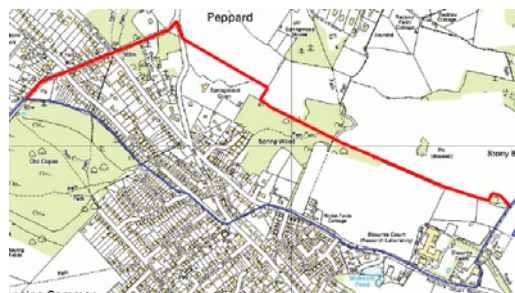
Map A - as finalised November 2013

We were and are still certain that those proposals met the letter and spirit of the Terms of Reference. To illustrate this in respect of CGR20, Map A shows in blue the existing boundary that is not 'natural or man-made' AND that goes through 'housing developments that straddle parish boundaries' .